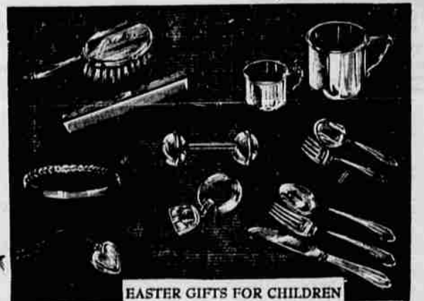
EASTER GIFTS FOR CHILDREN

VISIT OUR HAT BAR Hadley's 17 S. Central