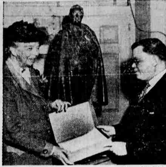
Roosevelt Papers —Mrs. Franklin D. Roosevelt receives from Wayne C. Grover, Archivist of the United States, the first box of papers of her late husband that were opened to the public at the Franklin D. Roosevelt Memorial Library in Hyde Park, N. Y. The five million pages of papers cover all of the late President's life from an announcement message written by his father a few minutes after his birth to what are believed to be the last words he wrote—"Let us go forward with strong and active faith."