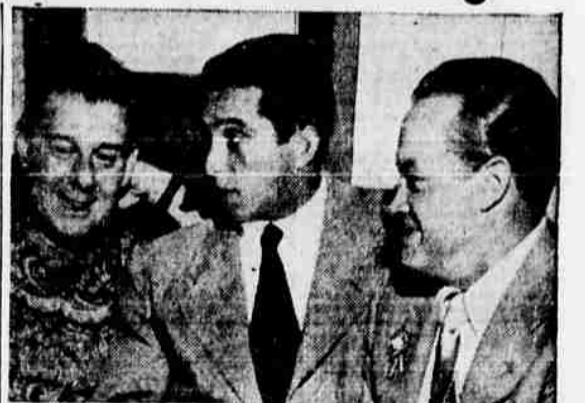
Arthur Godfrey, Perry Como and Bob Hope discuss plans for gala dedication of new Chesterfield factory and research laboratories before day-long celebration in Durham.

ferred to him as "the greatest salesman who ever stood before a microphone."