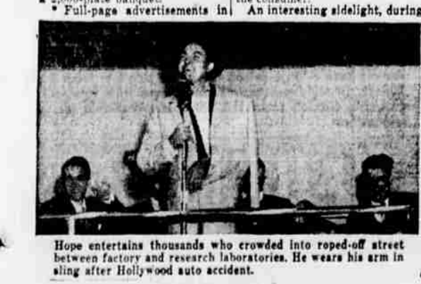
Hope entertains thousands who crowded into roped-off street between factory and research laboratories. He wears his arm in sling after Hollywood auto accident.

ferred to him as "the greatest salesman who ever stood before a microphone."