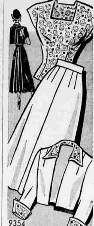
Marian Martin 9354

Three-piece ensemble you must have for Spring! Almost sleeveless blouse is starkly simple; skirt has wonderful double back pleat, bolero is smartly brief! Pattern 9354: 12, 14, 16, 18, 20. Size 16 bolero, skirt, 3 1/2 yards 39-inch; blouse and trim, 1 1/2 yards. This easy-to-use pattern gives perfect fit. Complete, illustrated Sew Chart shows you every step. Send TWENTY-FIVE CENTS in coins for this pattern to MARIAN MARTIN, care of Medford Mail Tribune, Pattern Dept., P. O. Box 6740, Chicago 80, Ill. Print plainly YOUR NAME, ADDRESS, SIZE, STYLE NUMBER. LOOK! A book of easy-sew Marian Martin Patterns for Spring. Send fifteen cents in coins for your copy and plan all the lovely new clothes you want! Patterns for everybody, plus a Free Pattern for a handbag printed right in the book.