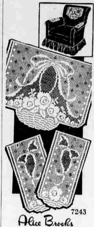
Alice Brooks 7243

Want a luxurious-looking chair for your next crocheting? This is it, yet it's inexpensive to make! Easy, too—follow the chart! All will admire this exquisite filet crochet! Pattern 7243, charts and directions. Our improved pattern—visual with easy-to-see charts and photos, and complete directions—makes needlework easy. Send TWENTY CENTS in coins for this pattern to Medford Mail Tribune, Household Arts Dept., P. O. Box 5640, Chicago 80, Ill. Print plainly NAME, ADDRESS with PATTERN NUMBER. Our ALICE BROOKS Needlework catalogue is the best ever! Send fifteen cents in coins, now for your crocheting, knitting, embroidery, toys, quilts, children's clothes. Free needlework pattern is printed in book.