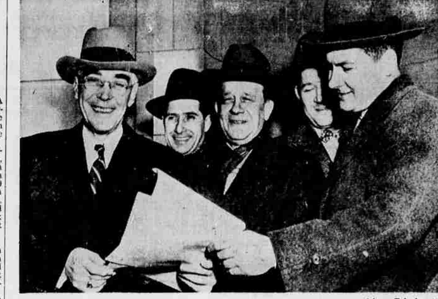
MINERS CLEARED OF CONTEMPT—Attorneys for the United Mine Workers display happiness and jubilation in Washington as they read statement which cleared the miners of civil and criminal contempt charges despite their refusal to obey a court order and call off the coal strike which threatens to cripple the nation.

HOURS: 10-12, 2-4, except Saturday afternoon and Wednesday