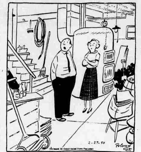
"I've seen other people's rumpus room. This looks about the same to me just the way it is."