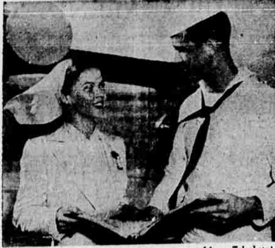
SHIRLEY TEMPLE TOURS PEARL HARBOR —Actress Shirley Temple discusses the Japanese attack on Pearl Harbor with H. George Baker, journalist, first class, during her tour of the Hawaiian naval installation. Baker is showing Shirley an album of pictures taken during the historic attack of Dec. 7, 1941. Miss Temple is vacationing in the Islands with her parents.

Early big league baseball used only the underhand pitch.