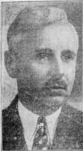
Dr. Will Durant

Dr. Will Durant, by general consent admitted to be one of the world's great historians, will be next speaker for the Rogue River Valley Knife and