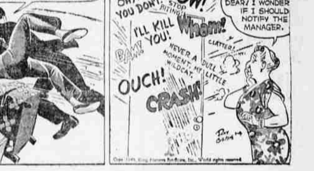
YOU AND I COULD BECOME CLOSE FRIENDS!