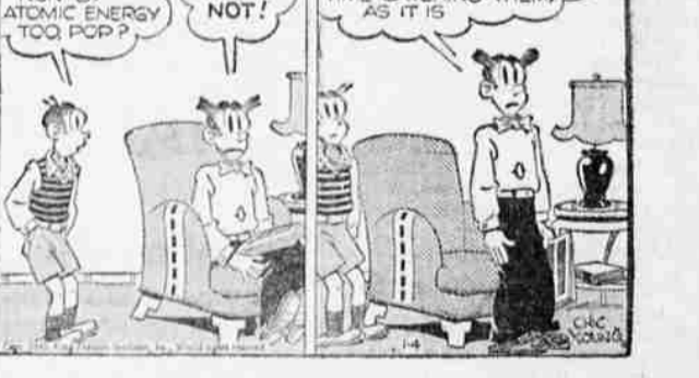
HIS NAME IS BROWN!—THEY CALLS HIM THAT!