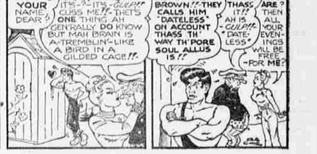
WHAT IS YOUR NAME, DEAR?