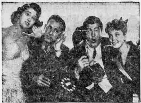
Frances Rafferty and Jean Porter listen in on an interesting conversation between Bud Abbott and Lou Costello in 'In Hollywood.'