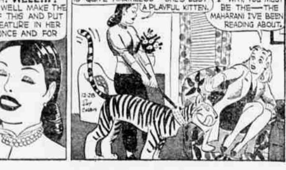
BARNEY GOOGLE and SNUFFY SMITH