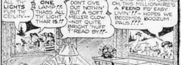
BARNEY GOOGLE and SNUFFY SMITH