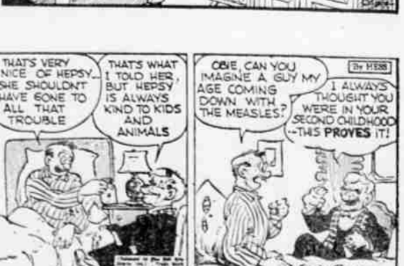
BARNEY GOOGLE and SNUFFY SMITH