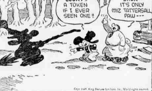
BARNEY GOOGLE and SNUFFY SMITH