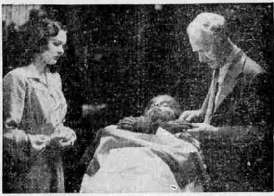
A scene from "Jungle Captive," one of the weirdest screen stories ever told which opened at the Rialto today and starring Otto Kruger and Amelia Ward. Van Johnson and Faye Emerson in "Born for Trouble," is the companion hit.