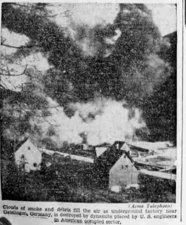
Clouds of smoke and debris fill the air as underground factory near Gelsenkirchen, Germany, is destroyed by dynamite placed by U. S. engineers in American occupied sector.