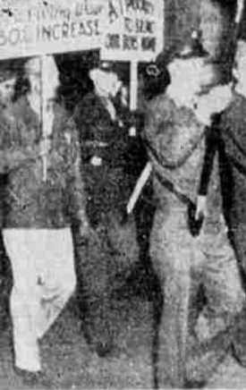
Ex-servicemen, members of United Auto Workers (C. I. O.) Union, on strike against General Motors, enter picket line at Montgomery Ward picket line in Chicago, wearing uniforms and carrying flags.