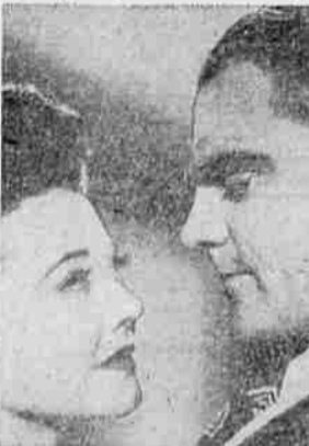
James Cagney as a hard-hitting reporter and Sylvia Sydney as a seductive Oriental beauty, match wits in the exciting "Blood On The Sun," opening tomorrow at the Holly theatre for a one-week engagement.

for meat, fats and sugar were to have been forwarded to the district office by Monday, Nov. 26, and after that date all petitions for adjustments, notifications as to transfer and sale of business and opening of new retail establishments will be handled by the food rationing division in the Portland office.