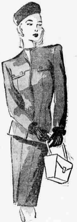
SUITS SECOND FLOOR