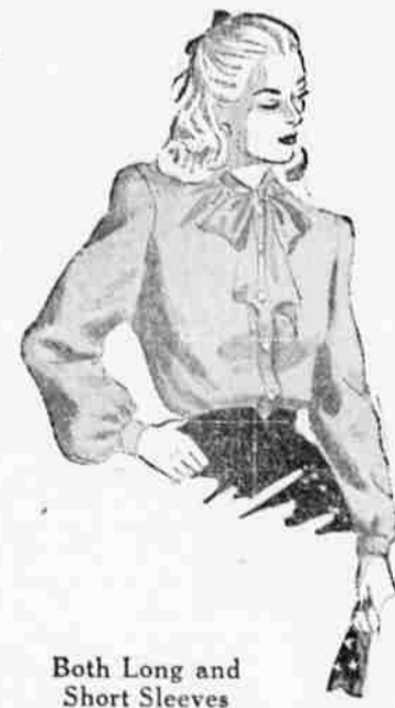
Both Long and Short Sleeves

For that important part of your Autumn Wardrobe—Your Blouse. Select one or two of these new arrivals. Here are colorful affairs in both long and short sleeve styles in shades to complement your new suit—Lime, Aqua, Pink, Coral and shocking. Your size is here.