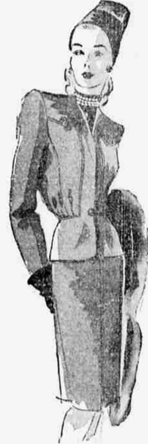
BROWNS GREENS PLAIDS

Yes indeed—Here are the kind of Suits American women like best. They're feminine. They're styled for dress or semi-sports wear. The jackets are cut just right and the skirts styled for detail. New sleeves, new shoulders and shown in Sage Green, Rich Autumn Browns and Smart Plaids. A suit for every figure type in this superb suit collection.