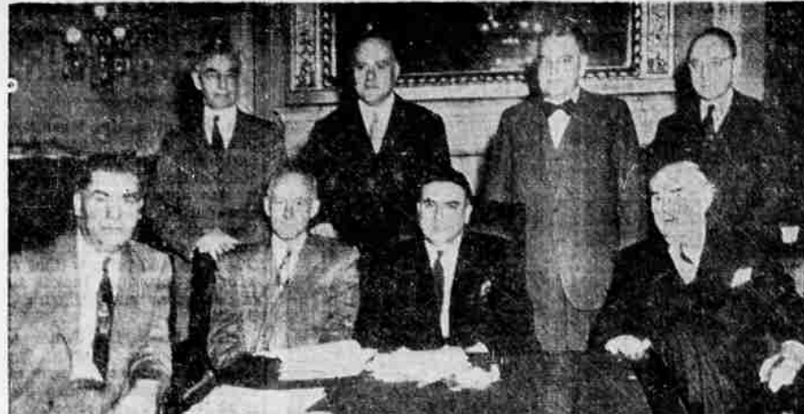
Newly appointed members of the Senate Atomic Bomb Committee gather for their first meeting to organize a staff and procedure for one of the most momentous tasks in Congressional history. Shown shortly before the doors were closed to the public are (front row, left to right): Senators Edwin C. Johnson, Colorado; Millard Tydings, Maryland; Brian McMahon, Connecticut; and Arthur Vandenberg, Michigan; (second row, left to right): Senators Thomas Hart, Connecticut; Eugene Millikin, Colorado; Warren R. Austin, Vermont; and Bourke B. Hickenlooper, Iowa. Members of the committee not shown are Senators Harry Byrd, Richard B. Russell and Tom Connally