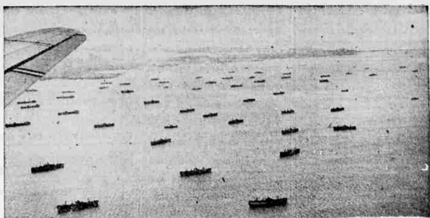
Few of the more than 200 merchant ships now idle and anchored in San Francisco Bay, California, waiting disposition by the War Shipping Administration. Some will be sent back to sea, others will be sold to private interests and many will go to Suisun Bay "graveyard." The newer, faster and more economical of these ships will become the backbone of the U. S. peacetime merchant fleet.