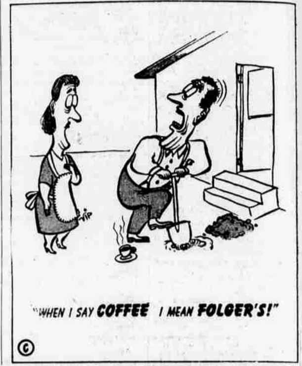
"WHEN I SAY COFFEE I MEAN FOLGER'S!"