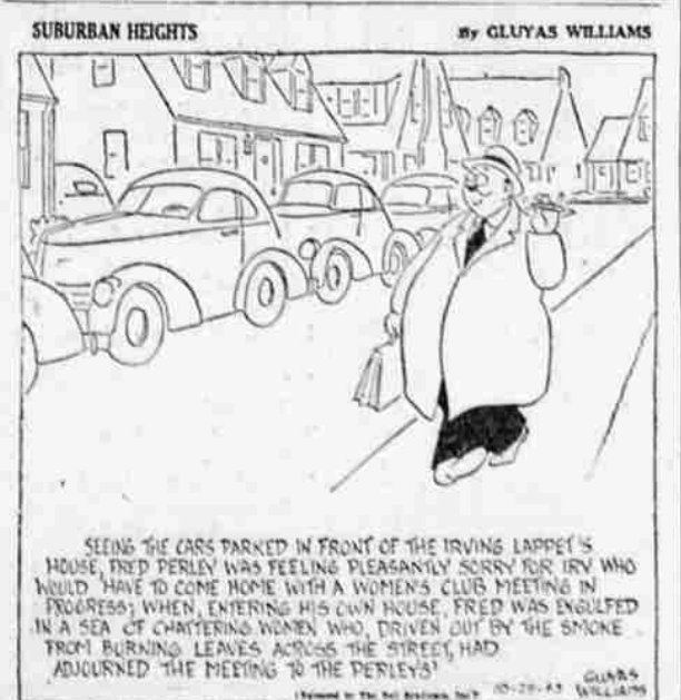
SUBURBAN HEIGHTS by GLUYAS WILLIAMS