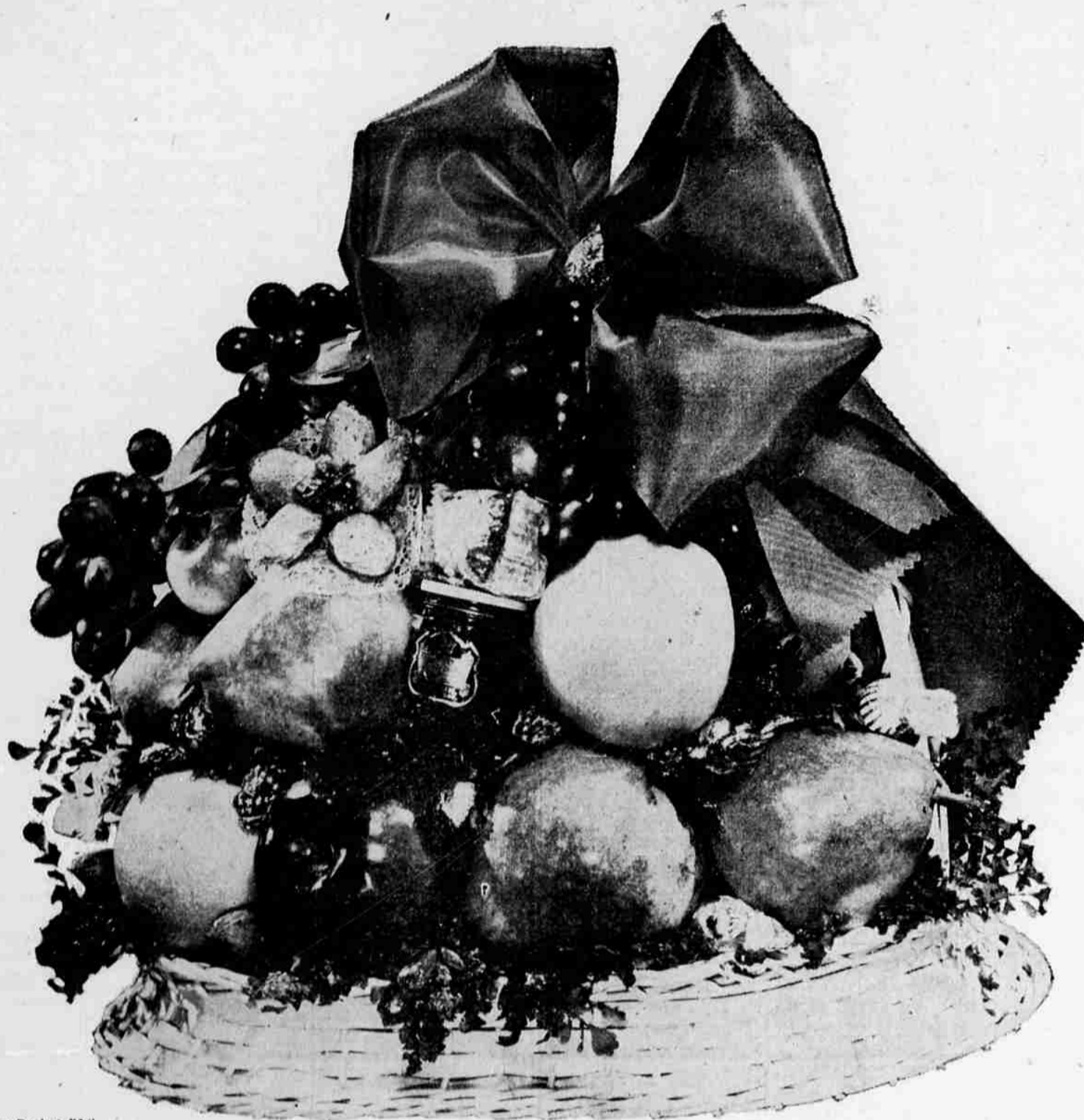
Our Basket "A" $7.95 Delivered

Come Learn the Fascinating Art of Fruit Arrangement While You