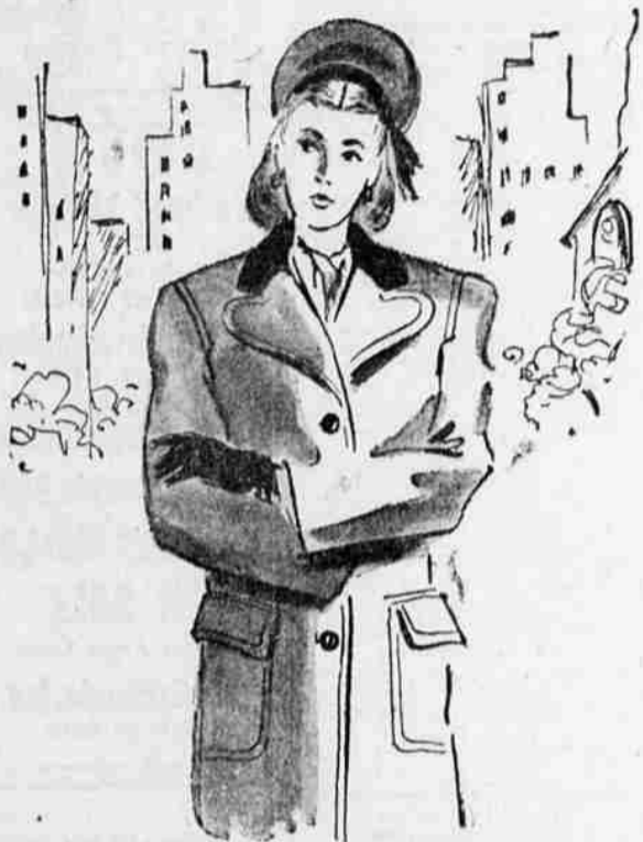
The Season's Dressy Coat!

"Take off your coat," the hostess invited. "Thank you," the guest said, "I'd be delighted!" She meant it, because (though she'd never confess) She was dying to show off her new Penney dress!