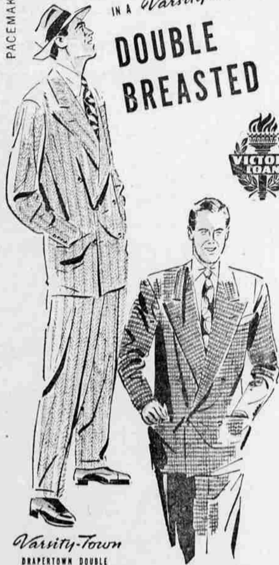
Varsity-Town DRAPTOWN DOUBLE

WE'D LIKE TO SEE YOU IN A Varsity-Town DOUBLE BREASTED