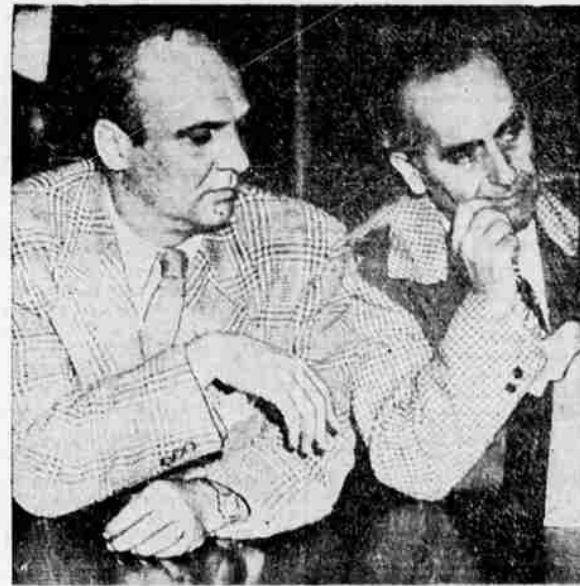
Lt. Jackie Coogan, 30, on terminal leave from the U. S. Army Air Forces, is booked by police in West Los Angeles, Calif., on "drunk in auto" charge. Coogan was found by officer who said the former child movie star was sleeping in a station wagon with motor running.