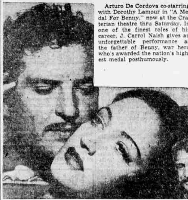
Arturo De Cordova co-starring with Dorothy Lamour in "A Medal For Benny," now at the Craterian theatre thru Saturday. In one of the finest roles of his career, J. Carroll Naish gives an unforgettable performance as the father of Benny, war hero who's awarded the nation's highest medal posthumously.

bership of the new group now has passed 100, and will remain open for about 25 additional members. The group is limited because it will become a dinner club when arrangements can be made. Early meetings, however, will be at an auditorium and to these members will be privileged to bring their immediate families as guests.