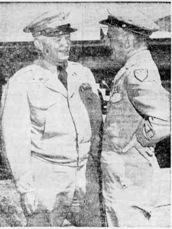
Gen. Carl A. Spaatz, commander of U. S. Strategic air forces (right) is greeted warmly by Gen. H. H. (Hap) Arnold, commander of U. S. Army air forces, upon his arrival at Hamilton Field, Calif., from his Pacific headquarters where he directed the Allied bomber offensive that devastated Japan's war-making industries, after finishing off those of Nazi Europe.

Here's One Of The Best Home Ways To Build Up RED BLOOD! You girls who suffer from simple anemia or who lose so much during monthly periods that you are pale, feel tired, "dragged out"—this may be due to low blood-iron. So start today—try Lydia E. Pinkham's TABLETS—one of the greatest blood-iron tonics you can buy to help build up red blood to give more strength and energy—in such cases. Taken as directed—Pinkham's Tablets are one of the very best home ways to get precious iron into the blood. They help build up the red quality of your blood and reinvigorate the hemoglobin of red blood cells. Just try Pinkham's Tablets for 30 days—then see if you, too, don't remarkably benefit. Follow label directions. Lydia E. Pinkham's TABLETS