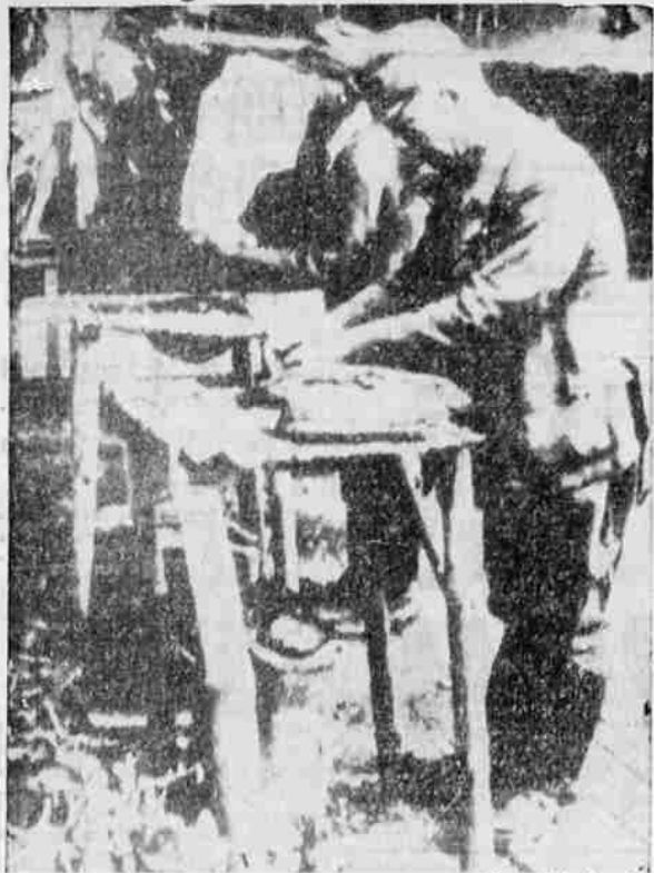
Using an American helmet, Gen. Tomoyuki (Tiger) Yamashita, commander of all Jap forces in the Philippines, washes his hands of the whole matter after surrender to the 32nd Division at Kianjan, in Northern Luzon. Defiant to the end, Yamashita delayed his surrender until his government formally capitulated on the USS Missouri.