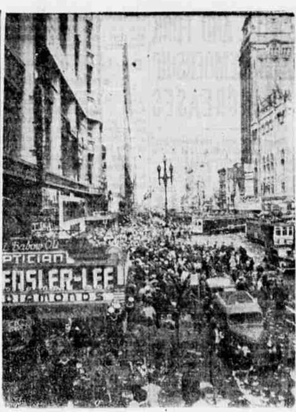
San Francisco's "premature" celebration of the end of the war with Japan which came when radio Tokyo announced Japan had accepted America's terms was nothing compared to the real celebration which began when President Truman officially announced victory. Here's the scene on San Francisco's famed Market street.