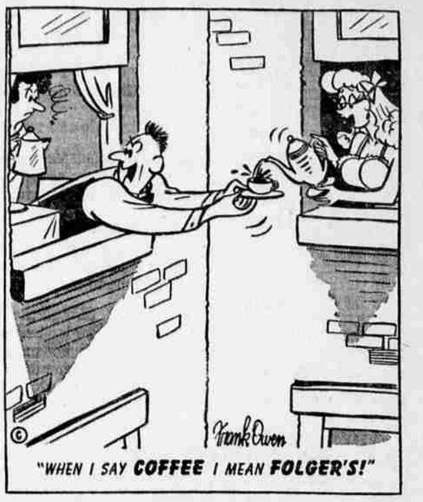
45-11 Produced by Raymond R. Morgan Co. for FOLGER'S COFFEE

husband of Heiress Barbara Hutton, who faces her divorce suit in superior court Aug. 30, will not contest the action, he indicated today. Miss Hutton, represented by Attorney Jerry Geisler, charged her English-born husband with causing her "grievous mental distress, suffering and anguish."