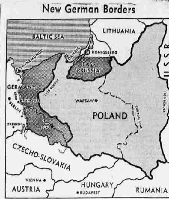
(Some Telephoto) Revision of Germany. Poland is given "temporarily" all territory west of her pre-war borders, up to Oder and Neisse Rivers, important port of Swinemunde, also Danzig and slice of East Prussia; northern part of East Prussia, including Königsburg, will go to Russia, until peace conference. Lithuania is also claimed by Soviets. Map shows eastern Poland 1939 border and "Curzon" Line, which Yalta agreement made new eastern limit of Poland.

Hurley said both the prospective butter churn and ice cream