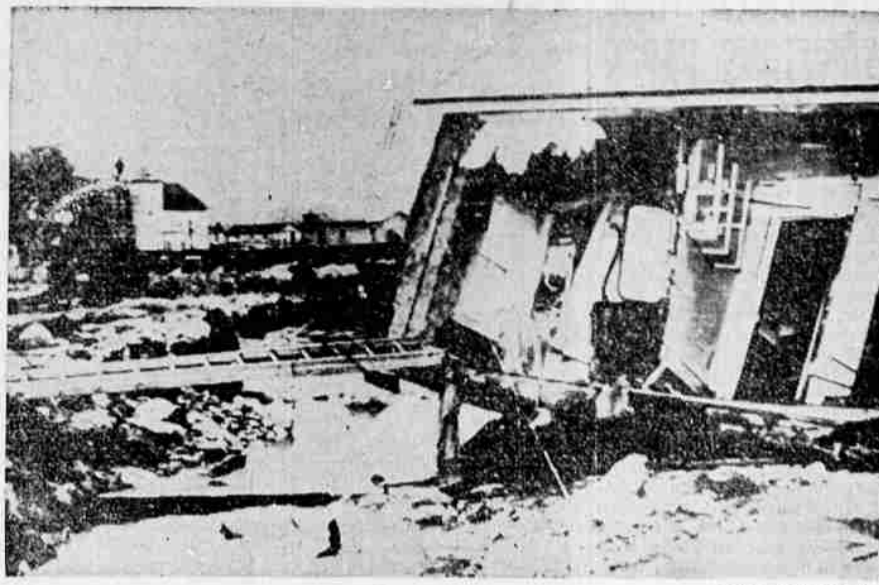
Rampaging Kinderhook Creek, swollen to river size in cloudburst, swept Steventown, N. Y., home off its foundation and washed away Rutland & Chatham Railroad bridge. Damage to highway and other property in Steventown was high and flash floods caused millions of dollars worth of damage in New York, New Jersey, Massachusetts and Pennsylvania.