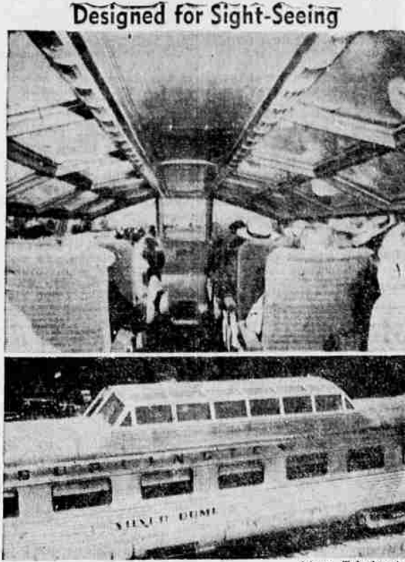
Passengers riding high under the glass ceiling of the Vista Dome car of the Burlington Railroad during test run. The car (lower photo) was designed to enhance the visual pleasures of traveling. The glass is ray resistant.

CLOSE OPA OFFICES Sacramento, July 30—(U.P.)—Confirming orders were issued in Washington today closing the Sacramento and Fresno district offices of price administration and transferring their functions to San Francisco effective Oct. 1.