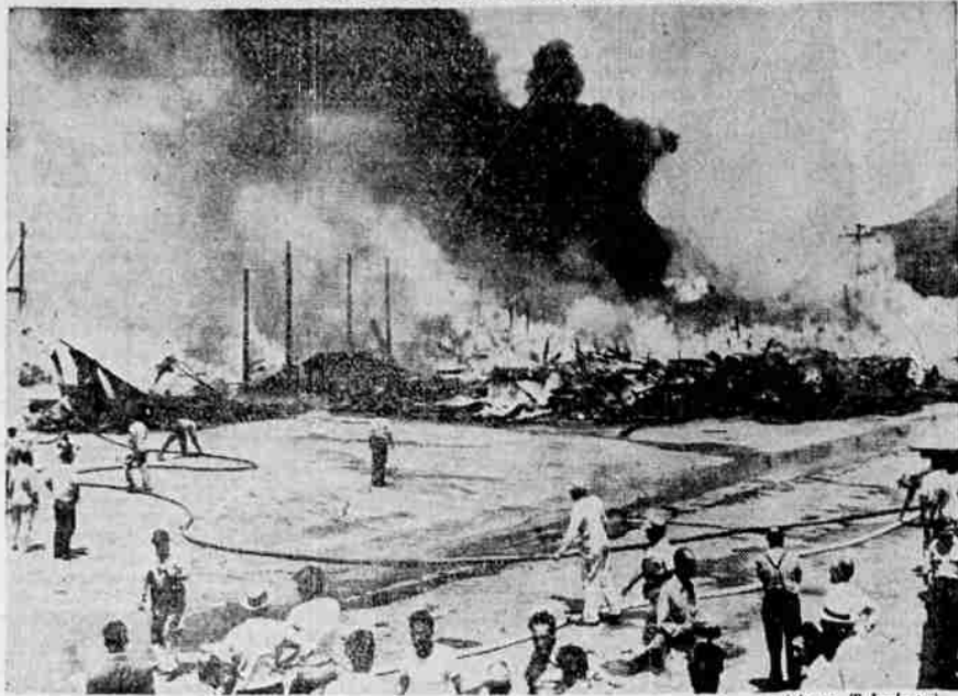
Movie crews and studio workers fight fire which started on a back lot of Universal Studio, Hollywood, Calif., which burned over one and a half acres destroying sets and irreplaceable stage properties. Studio officials estimate damage at $250,000.