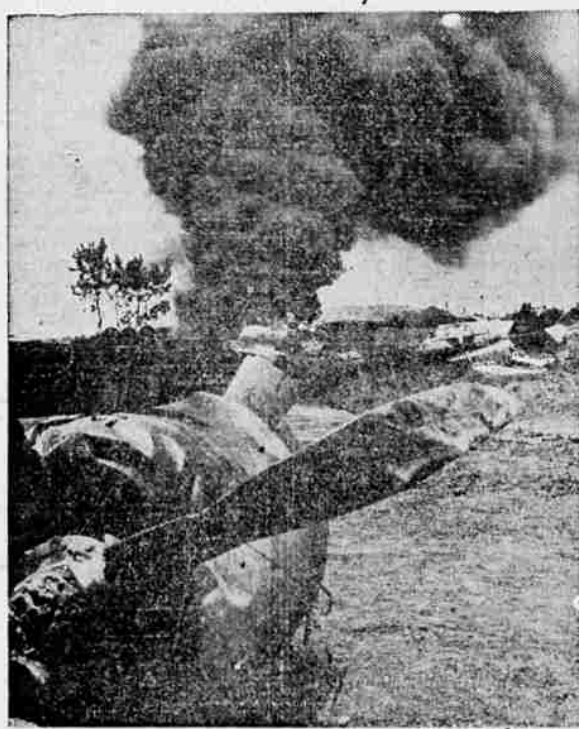
Broken and burning, this P-47 of an AAF fighter group in the Ryukyus crashed during takeoff for a strike against the Japanese homeland. The engine, foreground, was thrown ahead of the remainder of the wreckage, shown burning in background. Pilot escaped with minor injuries.