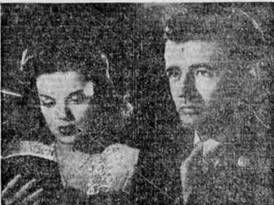
Judy Garland and Robert Walker are the young sweethearts in the timely and beautiful story, "The Clock," with James Gleason, now playing at the Craterian theatre through Tuesday.