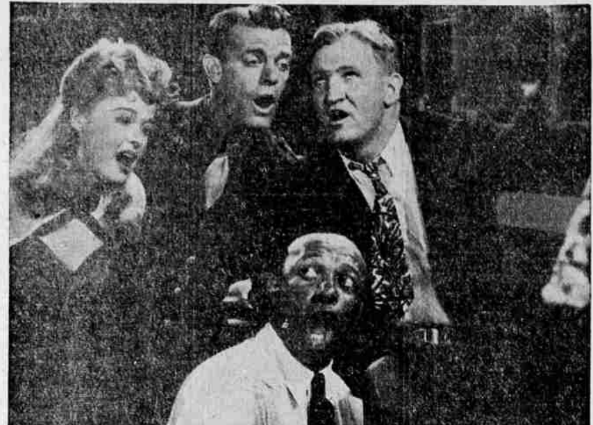
Close Harmony. With millions literally thrown into his pockets, Dennis O'Keefe and his pals ecstatically burst into song. Scene from "Brewster's Millions" now at the Craterian through Saturday with Helen Walker, Dennis, Joe Sawyer and "Rochester" at the piano.