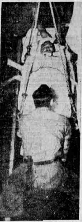
Capt. Dixie Keifer, USN, Kansas City, Mo. (since elevated to commodore), is raised through torpedo hatch on stretcher for transfer to hospital ship from Tinian, Saipan, after surviving blistering kamikaze attack off Formosa Jan. 21. Capt. Keifer, wounded 65 times in the attack, refused to leave bridge until fires were under control 12 hours after attack, then walked to sick bay until transfer.