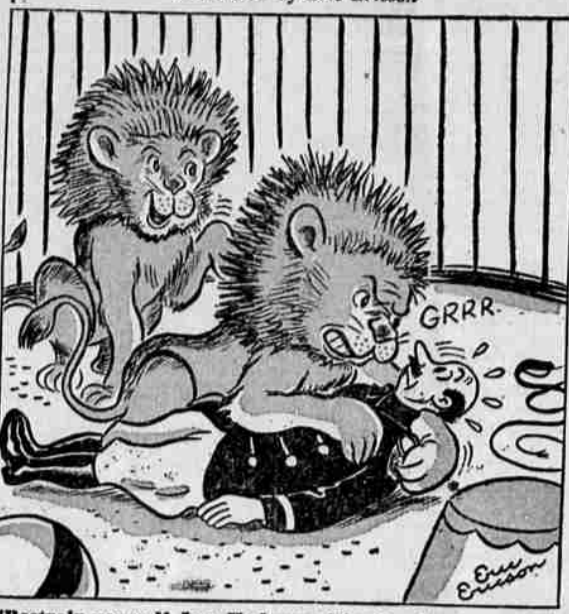
"Restrain yourself, Leo. He buys a War Bond every week."