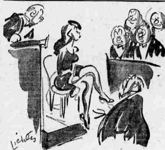
'Your honor, I object! The defendant is obviously trying to sway the jury by exhibiting her U. S. War Bonds.'