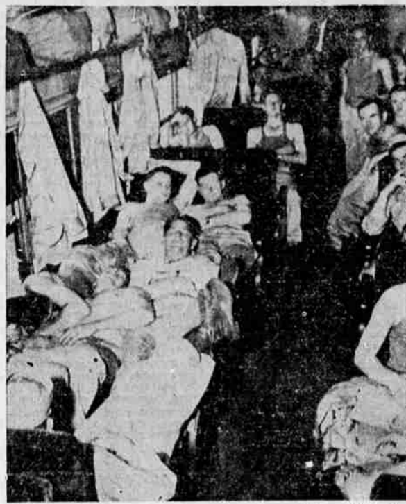
Typical of day coach accommodations given returning troops is this view of men trying to snatch sleep on crude beds made by dropping seat backs. These troops, at Camp Shanks, N. Y., face 65-hour train ride to Fort Lewis, Wash., providing transportation difficulties don't add to the time.