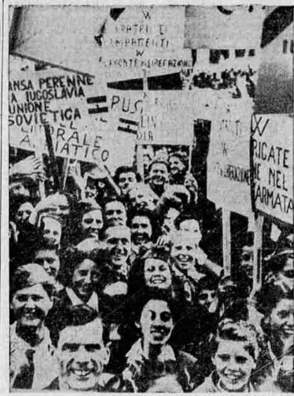
Enthusiastic Italian and Yugoslav patriots, carrying signs of welcome, greet troops of British Eighth Army, entering Montefalcone, 15 miles from Trieste, Italy.