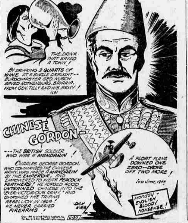
CHINESE GORDON — THE BRITISH SOLDIER WHO WINS A MANDARIN