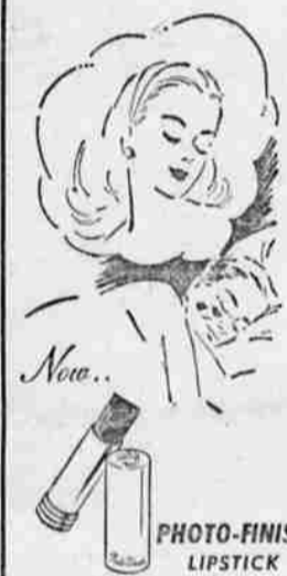
PHOTO-FINISH LIPSTICK ... such stuff as dreams are made on $1.00 plus tax

At last a lipstick that will be as indelible on your lips as on the impressions of your public! Six unforgettable shades to ignite the loveliness of your Photo-Finish Cake Make-up.