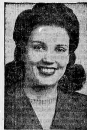
Margaret Pence Switchboard