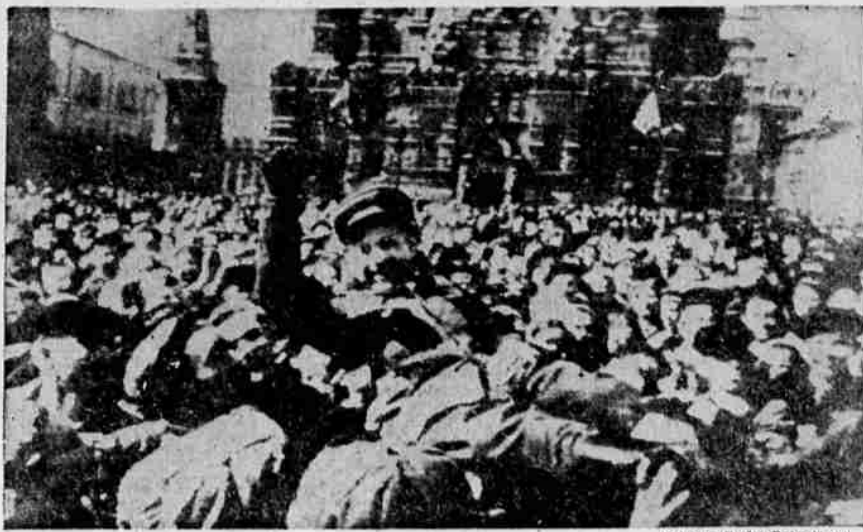
Jubilant Russians pack Red Square in Moscow, hoisting a serviceman on their shoulders as Russian capital joined with rest of Allied nations in celebrating end of war in Europe.