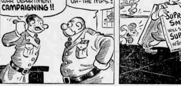
SERGEANT TWINKY IS OUT IN FRONT OF THE WAR DEPARTMENT CAMPAGNING!! CALL OUT THE COLDSTREAM—UH—THE M.P.S.!!