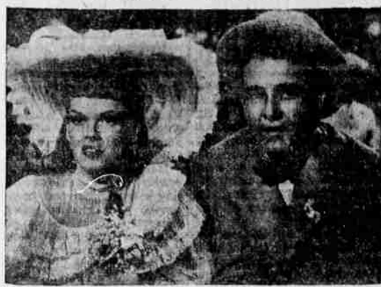
Judy Garland and Tom Drake in a scene from "Meet Me in St. Louis," the Technicolor hit, with Margaret O'Brien and Mary Astor.

mission in the Mediterranean theater of operations.