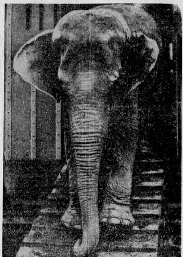
Saturday is Circus Day in Medford when Arthur Brothers, one of the world's largest amusement organizations, comes to Medford for one day only. Pictured above is one of the many elephants which will be exhibited.