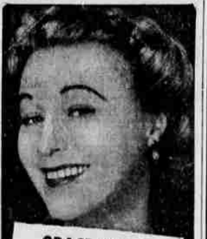
GRACE MOORE Star of the Metropolitan Opera says: "I have used Arrid for years and like it immensely...and I notice that Arrid is used by many of my friends in the stage, screen and radio world."

FOIL ENEMY CAMERAMAN Textile mills use the electric spectrophotometer to match camouflage colors so they can't be detected by German and Japanese infrared cameras.