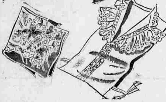
Penney's Main Floor

HANDKERCHIEFS .....33c Colorful, dainty, appealing.