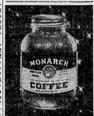
500 other MONARCH Foods—all Just as Good!

Most popular courses in spare-time studies offered soldiers of the Mediterranean Theater by Armed Forces Institute are book-keeping and accounting.