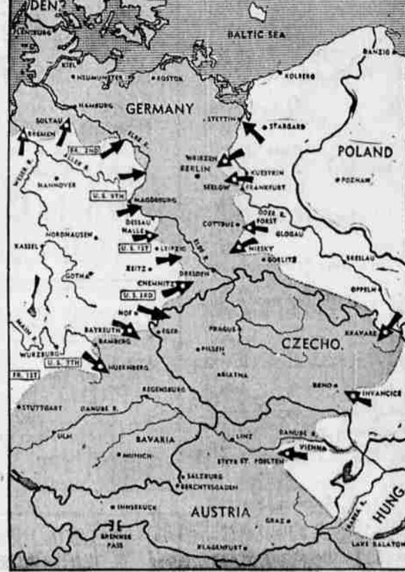
Capture of Leipzig by U. S. First Army topped keystone fortress of German defenses below Berlin. Americans also battled inside Nuernberg, Halle and Chemnitz with fall of those three major bastions expected soon. General Bradley announced Americans in eastern Germany have reached their immediate objectives and would pause—ostensibly to wait development of Russian drive which Berlin said had reached within 14 miles of Nazi capital after seizing Silesia and Wriezen. Far to the north, British and Canadians closed rapidly on Hamburg, reached Zulder Zee, drove for Amsterdam.