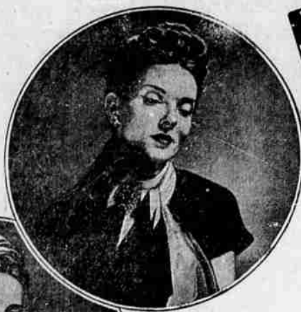
Twice as smart to wear Vitality Shoes and to select two-way accessories, such as the scarf, illustrated, that double for a turban.