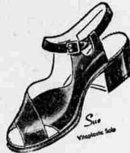
Sue Vitalonic Sole

VITALITY Shoes For Women Exclusive at Mann's