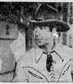
Starting Wednesday at the Rialto for four days is an action packed mystery thriller, "Ghost Guns," starring Johnny Mack Brown and Raymond Hatton. Topping the Rialto's twin bill policy is the Back-by-demand picture, "Manpower," with George Raft, Edward G. Robinson and Marlene Dietrich.

and, the laws of biology being what they are, in three weeks' time bills of fuzzy down will emerge, their eyes bright with innocence. One wonders how an old roue of a rooster and a bunch of termagant mothers can beget such adorables. But this column is not concerned with hatching; only setting. Surely you must realize by now there's technique to setting a hen as well as playing a good game of golf. One thing about setting a hen, you can eventually eat your score.