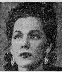
Jon Hall and Moria Montez are once again co-starred as sweethearts in the technicolor picture "Gypsy Wildcat," coming Wednesday to the Craterian. Also included in the cast are Peter Coe, Leo Carrillo and Gale Sondergaard.